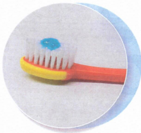
Use a pea-size amount for children ages 3 to 6.

This handout was prepared by the National Center on Early Childhood Health and Wellness under cooperative agreement #90HC0013 for the U.S. Department of Health and Human Services, Administration for Children and Families, Office of Head Start.