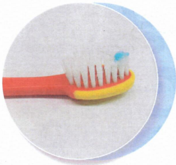
Use a smear for children under age 3.